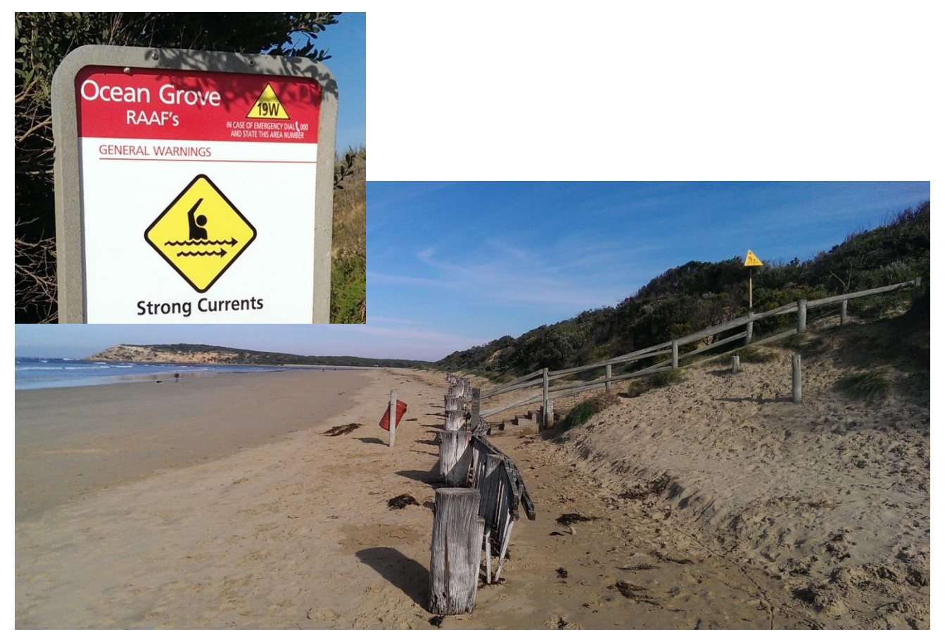
RAAFs Beach 2020

And therein lies the tale of how RAAF's got its name!