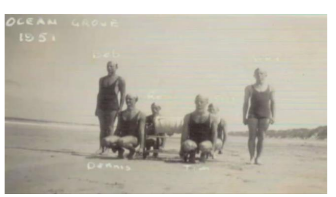
RAAFC SLSC training on Ocean Grove main beach 1951

<sup>1</sup>Photos from 50 Years and More. A History of Surf Life Saving Victoria